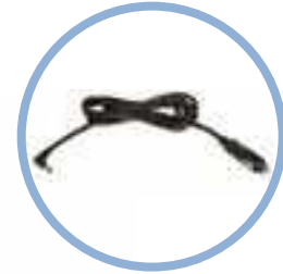
Inogen One ® G3 DC Power Cable* Item # BA-306