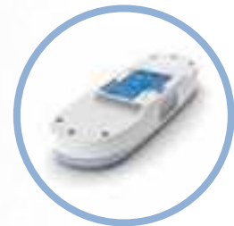
Inogen One ® G3 Lithium Ion Battery* Up to 4.7 hours run time Item #BA-300