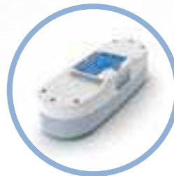
Inogen One ® G3 Extended Life Lithium Ion Battery** Up to 10 hours run time Item #BA-316