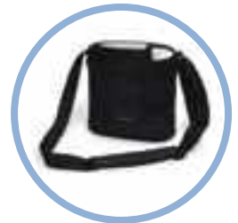
Inogen One ® G3 Carry Bag* Item # CA-300