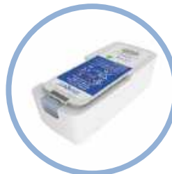
Inogen One ® G5 Extended Life Lithium Ion Battery** Up to 13 hours run time Item #BA-516