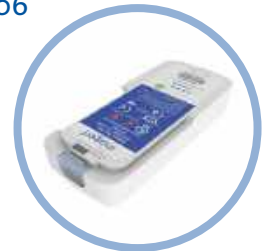
Inogen One G5 Lithium Ion Battery* Up to 6.5 hours run time Item #BA-500