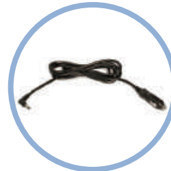
Inogen One G5 DC Power Cable* Item #BA-306