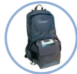
Inogen One G5 Backpack** Item #CA-550