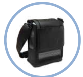
Inogen One G5 Carry Bag* Item #CA-500